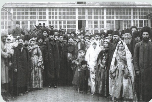
חתונה בראשית המאה העשרים