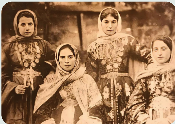
נשים יהודיות הרריות בתחילת המאה העשרים