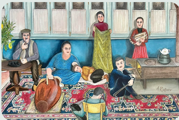
הווי משפחתי קווקז. הצייר אלברט רפאלוב